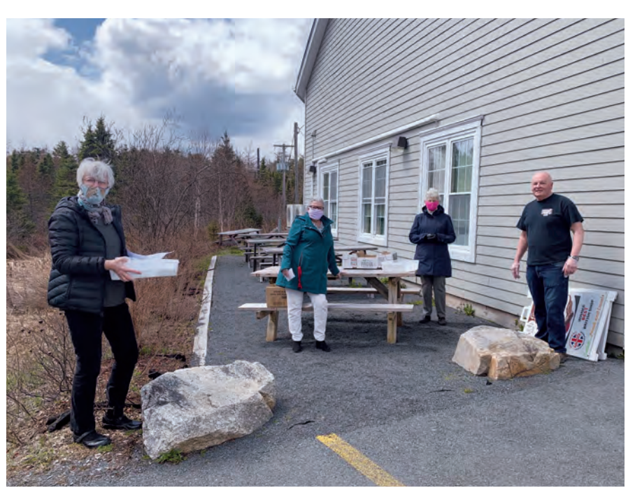
Collecting meals made by Delish Fine Foods in Upper Tantallon for delivery to seniors. Money for the meals was donated by members of the community.

Locally, branch members have made masks for distribution, delivered meals to older folk who were not able to get out, checked in by phone with those who are alone, made twiddle muffs for those suffering from dementia, contributed financially to the Mission to