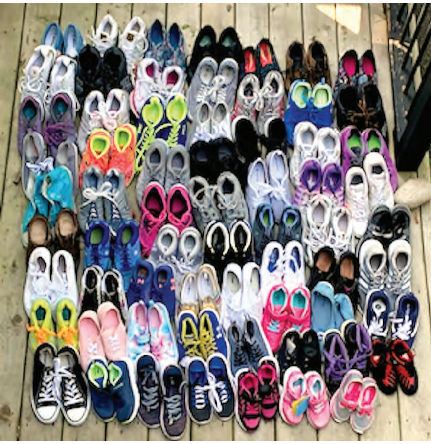
Indoor shoes ready to go to Nunavut.