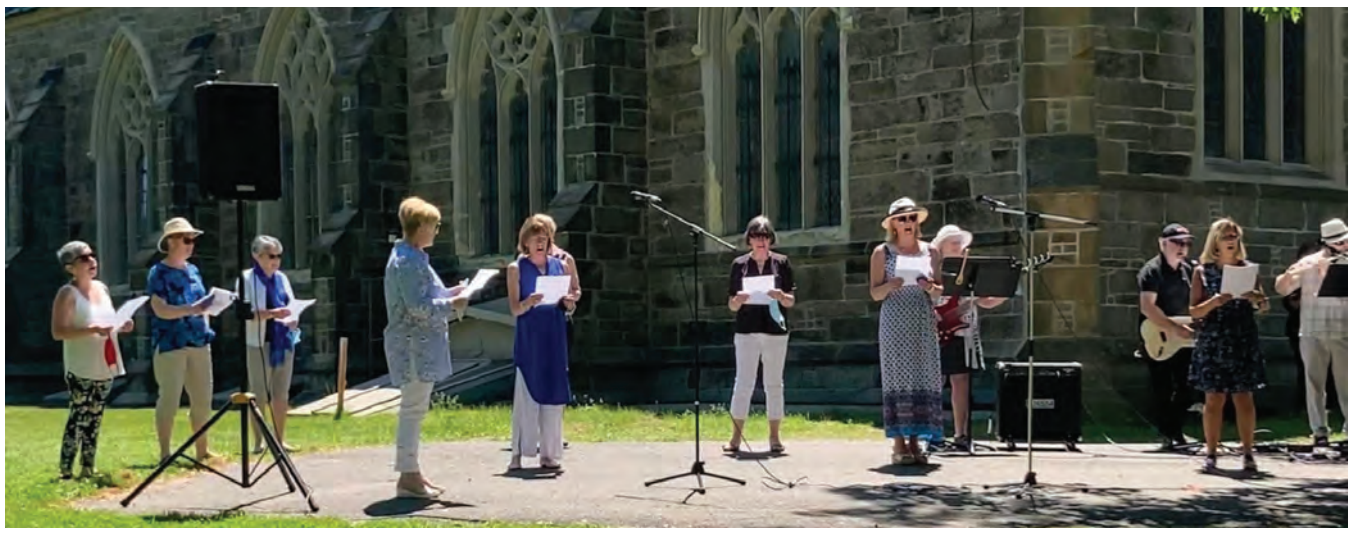
Christ Church Cathedral MU Choir performed "Here I Am, Lord" to end our variety show fundraiser.