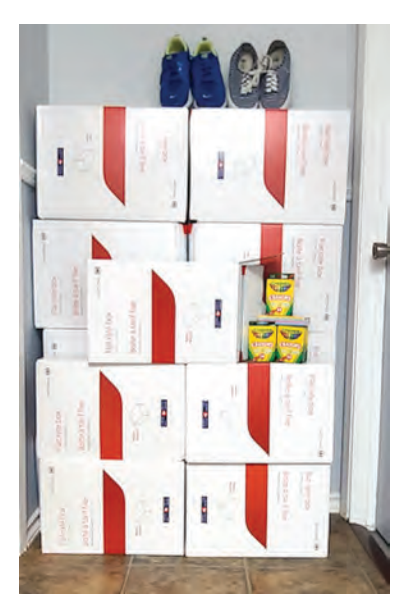
Boxes full of shoes and school supplies sent to Nunavut

The branch hopes to keep in contact with the school and send needed supplies to them again this year.