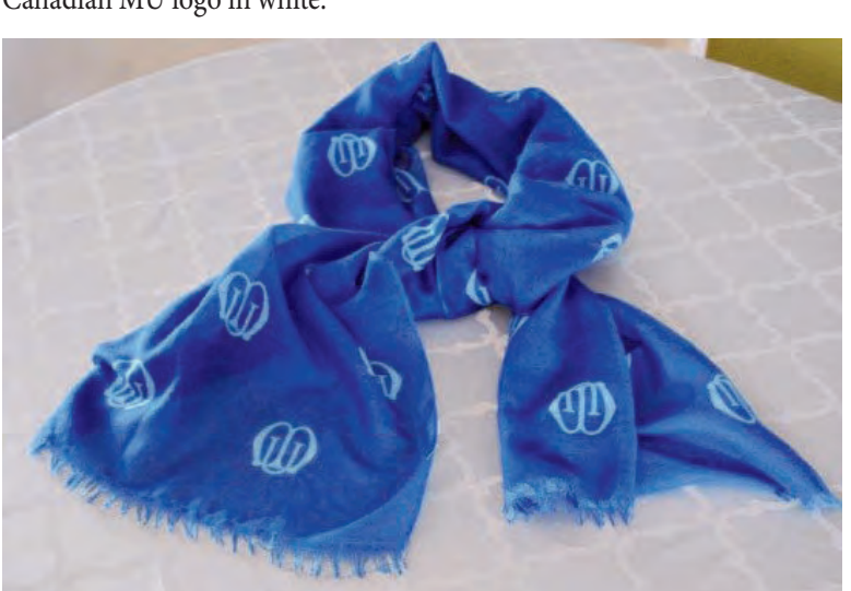
Scarf: Mothers' Union blue with white logos. 27" x 60" (68 cm x 183 cm). Lightweight Viscose. Sourced from Mary Sumner Enterprises.