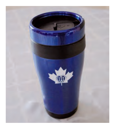
Travel Mug: 14 oz. (450 ml). Blue insulated hot/cold.

6" x 9" (15 cm x 23 cm). Black with blue maple leaf and white MU logo. Pen and paper are included.