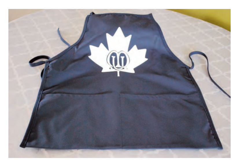
MU Apron : One size fits all. Navy blue apron with 2 deep pockets and the Canadian MU logo in white.