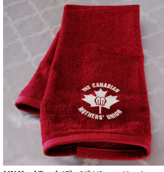
MU Hand Towel: 17" x 26" (42 cm x 66 cm). Lovely burgundy hand towel with the Canadian MU logo in white.