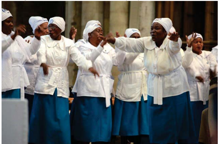
Mothers' Union "Mary Sumner Choir" from Zambia sing at the 140th anniversary service at Winchester Cathedral