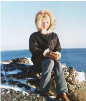
In St. Anthony, NL