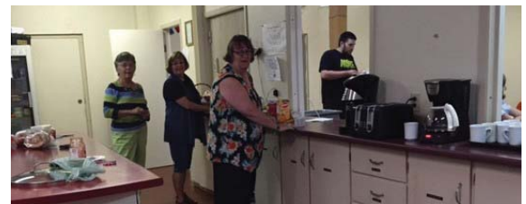
St. John the Baptist, North Sydney