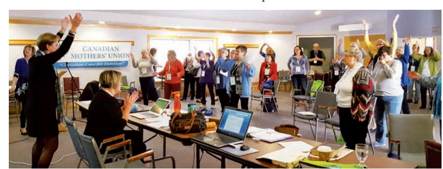
Singing the theme song, 'God is on the Move'

her love for that community where she and her husband plan to retire.