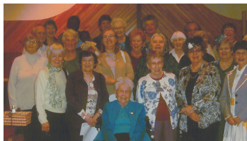
Left, Canadian Mothers' Union 125th Anniversary celebration at the Diocesan Wave of Prayer Service