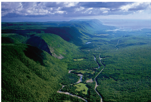
The Cape Breton Highlands and the Cabot Trail are truly breathtaking!

Although Cape Breton is a relatively small place, we have lots to show you. So trying to narrow down the tours will be a challenge as well....because we want all of you to enjoy at least one ...we have a few National Parks (Louisburg, Alexander Graham Bell, Gaelic College, Highland Village), hiking to falls, walking tour of Baddeck (which is really quite interesting), the famous Cabot Trail, Whale Watching, and one surprise.....there are many more, something for everyone, and you won't be disappointed.