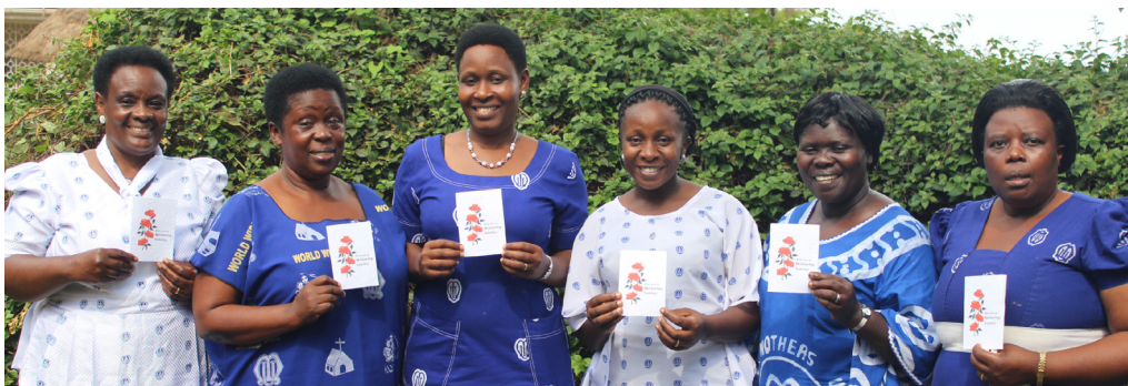
Ugandan MU coordinators holding the 2020 Make a Mother's Day seeded cards

rather than just individuals. Mothers' Union is reaching out to children and youths through schools, giving talks on hygiene and relationships. They are also counselling parents in the community, especially on issues such as early child marriage.