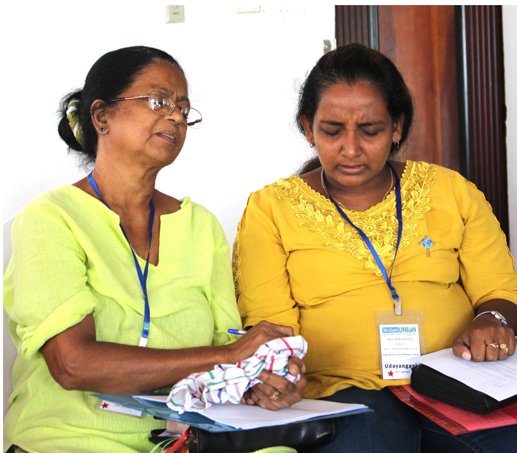
Members from Sri Lanka and India praying at MULOA workshop