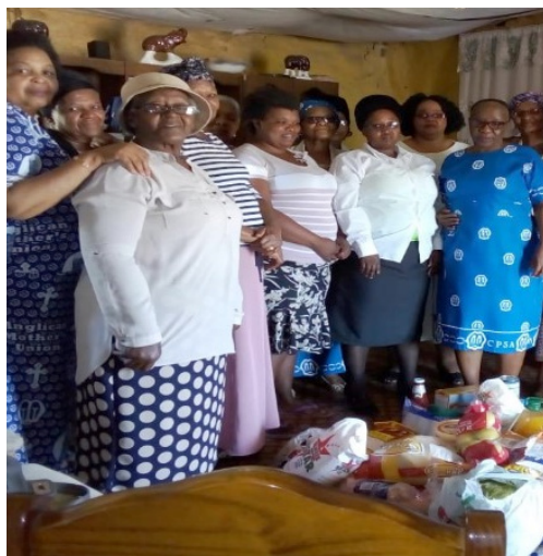
Members delivering groceries

L istening has played a crucial role and had a major impact amongst members in our zone since the inception of MULOA. Members have learned to listen carefully to others and act according to what they have heard. Mothers' Union is now able to mobilise relevant government structures as well as NGOs to intervene and help the communities in need. Communities are also encouraged to use their skills as well as their available resources to sustain themselves.