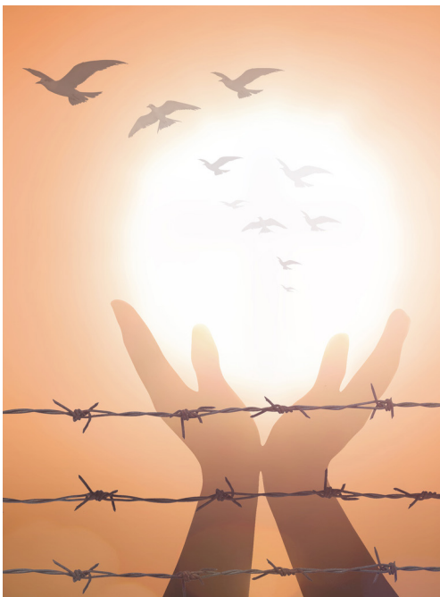
Giving hope to prisoners in the Diocese of Durham

M ULOA has had a really positive effect on rejuvenating the members in this zone and has enabled the continuance and even reopening of some branches in the Province of York. However, our biggest challenge continues to be a decreasing membership and we only have a small number of “active” members in the zone.