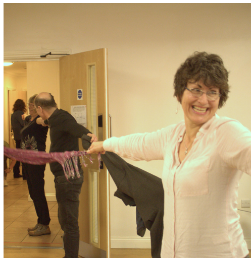
Part of a Metamorphosis taster day

M ULOA has encouraged the members to reengage with their faith and with Mothers' Union. It is empowering some to lead sessions and is helping them to see a wider role than just organising a branch meeting with a speaker. In some places, it has also had a positive impact on relationships between churches and MU because we are engaging with church membership in a way that both can be involved in personal growth and faith-based growth.