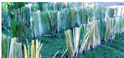
Vetiver – a fast growing grass which preserves the soil during the rainy season

The biggest challenge in our zone is social injustice and so tackling this is our priority for 2020.